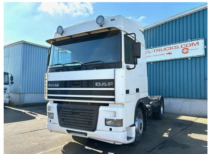
DAF 95.380 XF SPACECAB (EURO 2 / ZF16 MANUAL ... 4x2