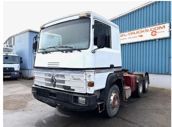
Renault R385 Major 6x4 SPRING SUSPENSION/LAMME (ZF... Referenznummer: SN 59970039 Z