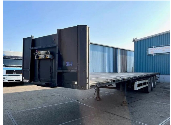
Van Hool 3B1047 13.60M. FLATBED TRAILER WITH 40FT ...