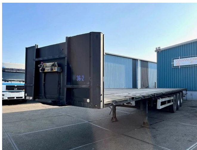
Van Hool 3B1047 13.60M. FLATBED TRAILER WITH 40FT ...