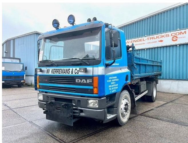
DAF 65.210 ATI 4x2 FULL STEEL KIPPER (EURO 2 / MANU...