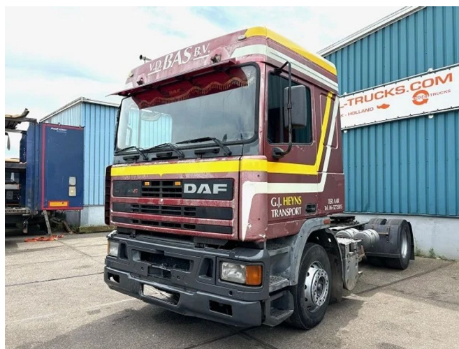
DAF 95.360 ATI SPACECAB (DUTCH TRUCK) (EURO 2... 4x2