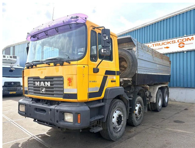
MAN FE 410A 8x4 FULL STEEL KIPPER (ZF16 MANUAL G...