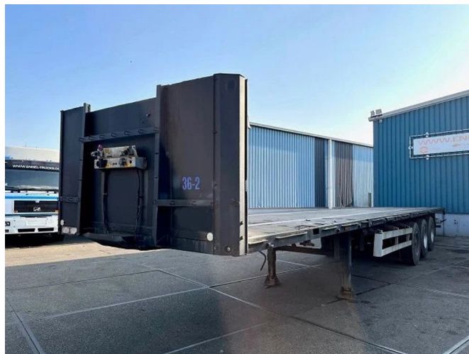
Van Hool 3B1047 13.60M. FLATBED TRAILER WITH 40FT ...