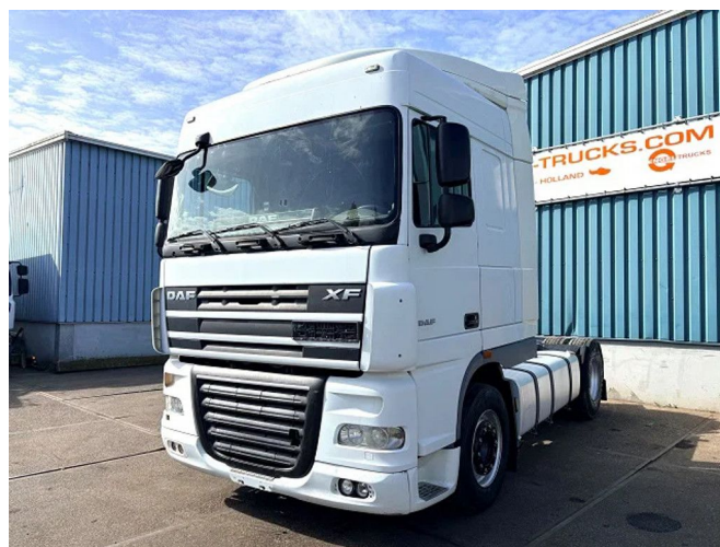
DAF XF 105.460 ATE SPACECAB 4x2 (EURO 5 / AS-TRONIC...