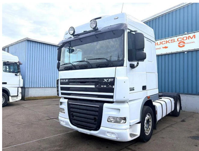
DAF XF 105.460 SPACECAB 4x2 (EURO 5 / AS-TRONIC / ZF...