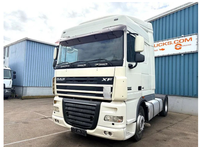
DAF XF 105.460 SPACECAB (EURO 5 / ZF16 MANUAL... 4x2