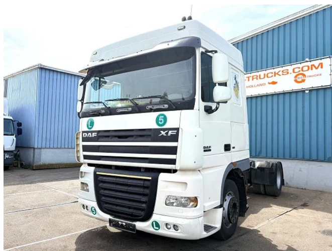
DAF XF 105.460 SPACECAB (EURO 5 / ZF16 MANUAL... 4x2