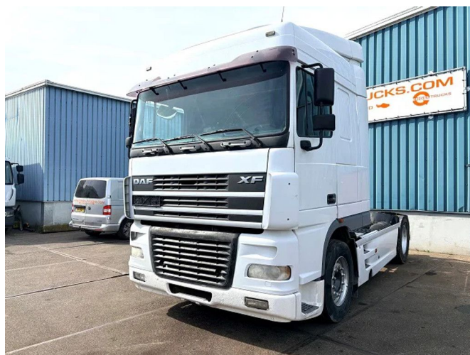
DAF XF 95.430 SPACECAB (EURO 4 / AS-TRONIC / F... 4x2