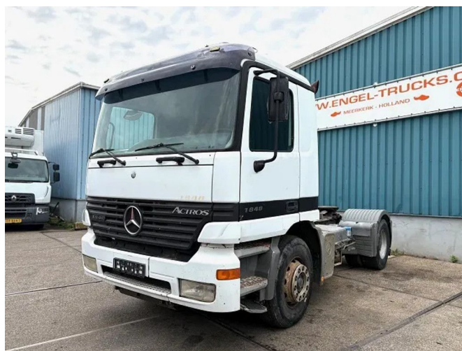
Mercedes-Benz Actros 1848 LS (MP1) 4x2 TRACTOR (EPS ... Referentienummer: SN 58789913 Z