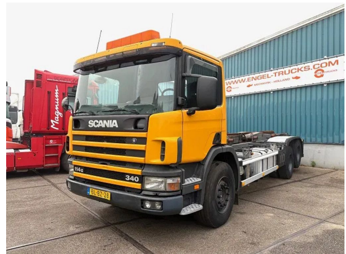
Scania P114-340 6x2 WITH MULTILIFT CONTAINERSYSTEM...